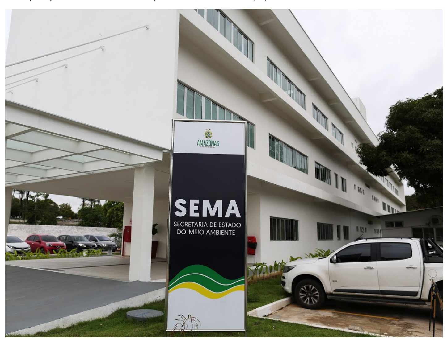
The Amazonas State Environmental Department (SEMA-AM) operates in a new building, opened in February 2020